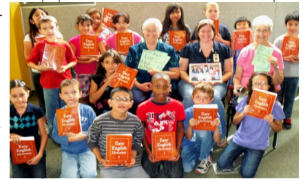
Students with their new dictionaries

very fun to see these students so engaged. We received thank you notes and cards from each student. You can see them on the Peoria Chapter bulletin board on your next trip to the Lodge. The staff members at PDS continue to be so extremely grateful for our generous donation and very much hope that we will be able to continue this project for years to come!